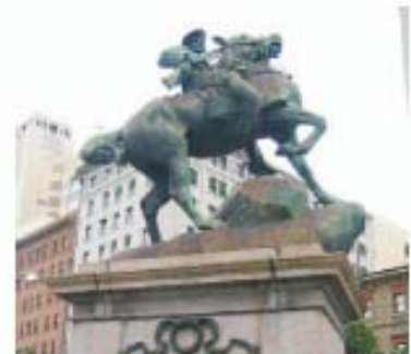
THE MEMORIAL WILL FEATURE A MOUNTED TROOPER CAST IN BRONZE WITH PLAQUES

The British made political scapegoats of three Australians, Harry 'The Breaker' Morant, Peter Handcock and George Witton, sentencing them to death. Morant and Handcock were shot and Witton gaoled in England. Due to the furious reaction of the Australian Government, Witton was later released and pardoned.